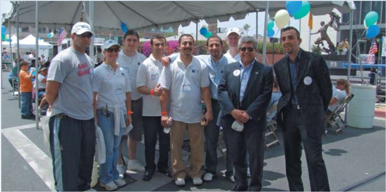
Team Fiscal at the Great American Clean-up in Glendale.